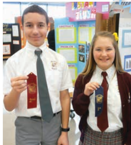
The Science Fair is just around the corner!

The Science Fair will be held in February.