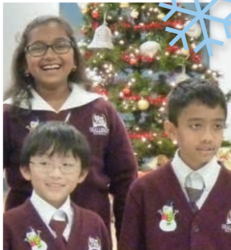
Christmas is a joyful time at Challenger!

Class finalists qualified for the campus bee, which utilized words and vocabulary from the Scripps National Spelling Bee. Congratulations to our fantastic spellers!