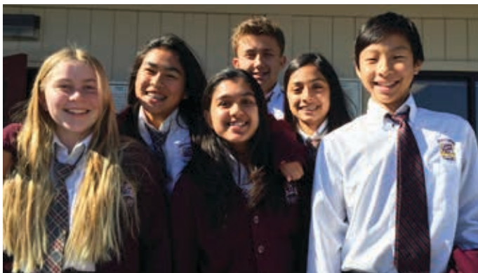
Challenger students are ready for a new year of learning and fun.