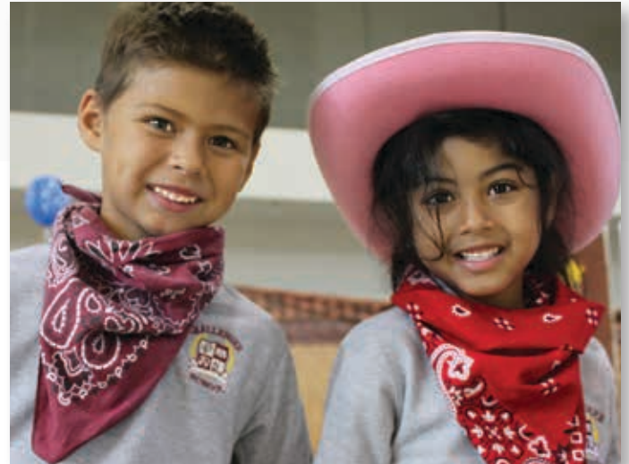
Preschoolers and kindergartners will have some boot-scootin' fun while learning about Old West culture at Western Day.

We reckon that students will have a rootin'-tootin' good time!