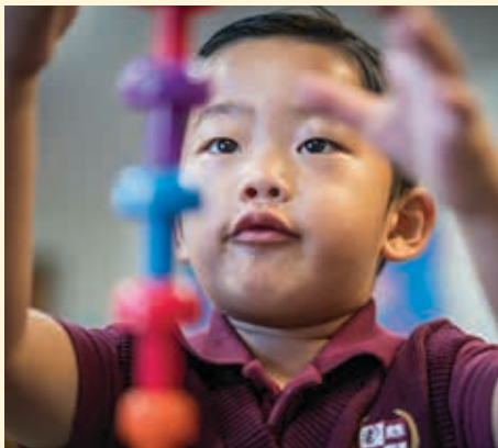
Challenger preschoolers have fun while learning skills and developing self-reliance.

Don't miss our Parent Workshop at 7 p.m. on Thursday, August 31. Your support and implementation of Challenger's learning and behavior techniques will help maximize your child's learning and development.