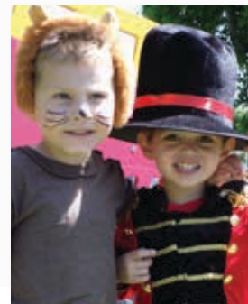
Circus Day is fun for everyone!

On the last day of classes, students may come in costume if they wish. We'll play games and have lots of laughs and circus-themed activities.