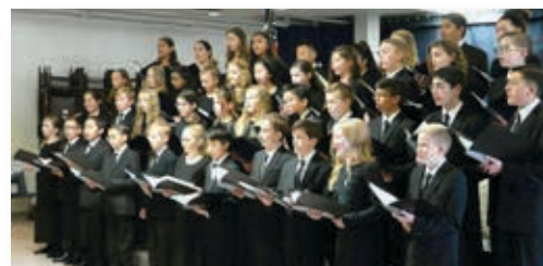
2017 Utah Region Honors Chorale

Congratulations to the 2017 Utah Region Honors Chorale for an outstanding musical performance on Saturday, April 22. Forty-three fifth through eighth grade students from our Salt Lake, Sandy, and Traverse Mountain campuses participated.