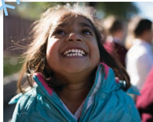
Learning and fun—it's the Challenger way!