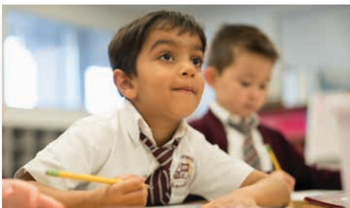
Challenger students are taught to rely on the strength of their own minds.

“Not really,” Embry mused. “You do have your own mind!”