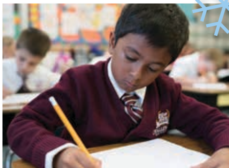
Challenger students will take the Iowa Assessments in a few weeks.

Our students have a history of performing very well on national standardized tests, and we are confident that this year they will continue to prove the benefit of a Challenger education!