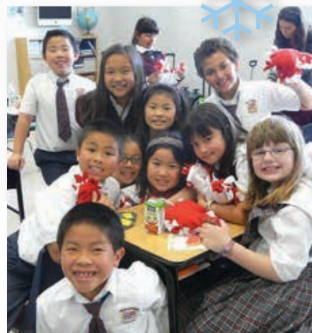
Challenger students will learn about the origins of Valentine's Day customs this month.

Note: Please do not send food, toys, or gifts with your child. Treats will be furnished by Challenger.