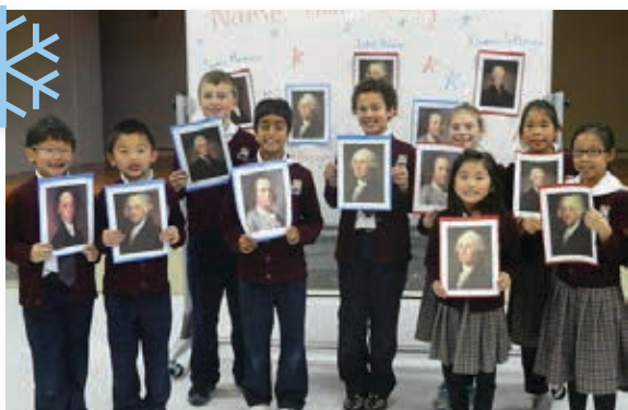
Challenger School will hold a special Founders Assembly this month.