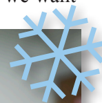
Challenger students are achievers!