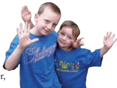
Summer school was great fun, and students received T-shirts.