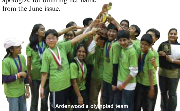
Ardenwood's olympiad team