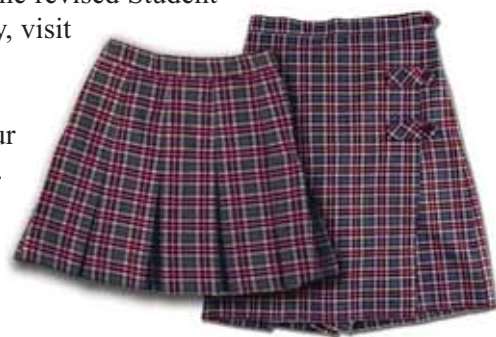
Girls' pleated skirt (left) and culotte (right) for grades 5–8

For a copy of the revised Student Uniform Policy, visit Challenger’s website and navigate to your campus’s page. It is available for download as a PDF.