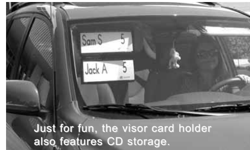
Just for fun, the visor card holder also features CD storage.

We have given parents a holder for visor cards, which can display one or more cards on the passenger-side visor for the drive-through line. Please go to the school office to get your holder if you were unable to attend orientation or Visor Card Day.