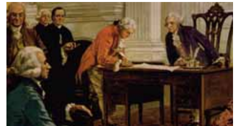
The Foundation of American Government by Henry Hintermeister

Challenger elementary students will commemorate these two September holidays with an assembly on Friday, September 11.