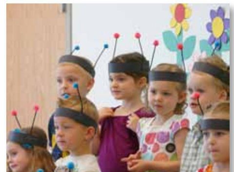
Everest (ID) preschoolers delighted audiences with their spring program "Bugs."

Kudos to our students and teachers for once again making our spring programs a smashing success! Audiences raved about the enthusiasm, preparation, and talents of the students.