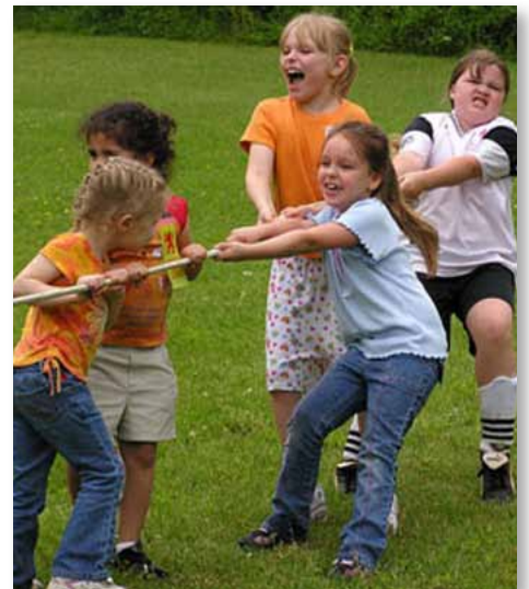
Students have a blast at Field Day!

Please note that, instead of participating in field day, preschool and kindergarten classes will have Circus Day activities.